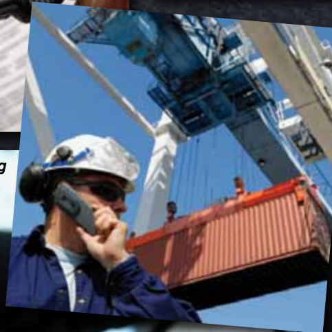
Global Supply Chain